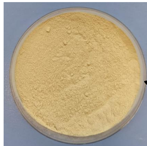
Orange by-product (peel) powder