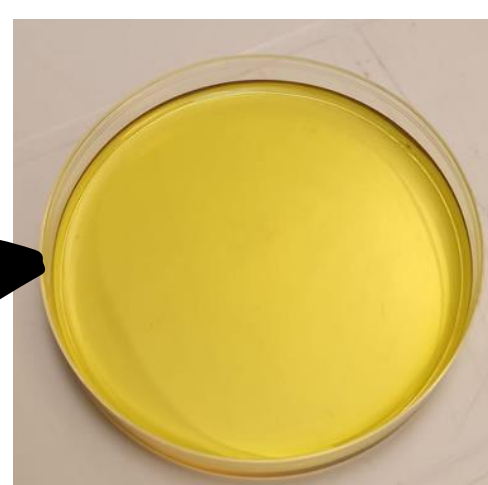
Flavoured olive oil