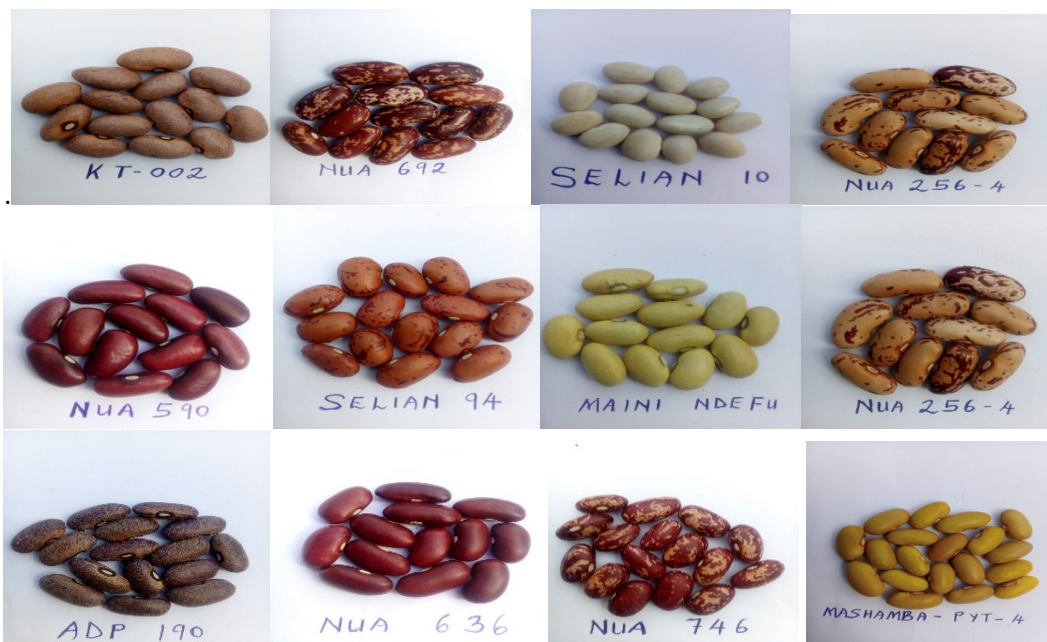
Figure 3: Seed types of some of the selected bean lines showing the variability in seed characteristics