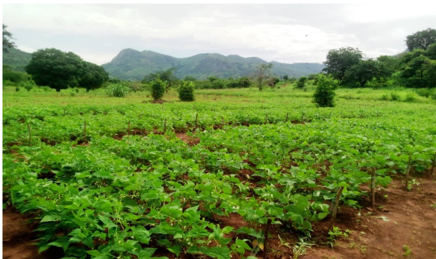
Figure 3: Bean lines in the field at SUA

There was variation in the performance of the 90 bean lines for the traits that were assessed in the on-station experiments. Figure 3 shows how bean lines were performing in the field and Table 2 gives the summary of performance of these lines.